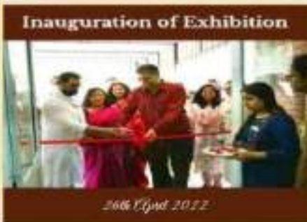
Inauguration of Exhibition