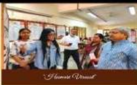
"Flower & Vase"