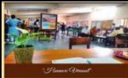
"Flower & Vase"