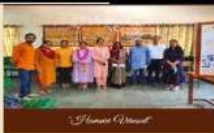
"Flower & Vase"