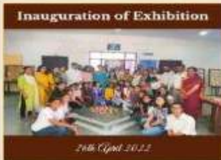
Inauguration of Exhibition