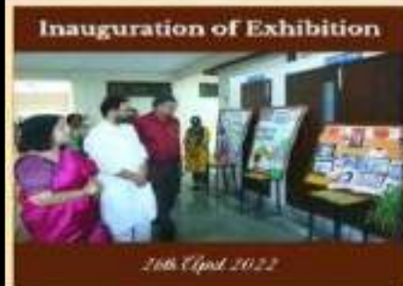
Inauguration of Exhibition