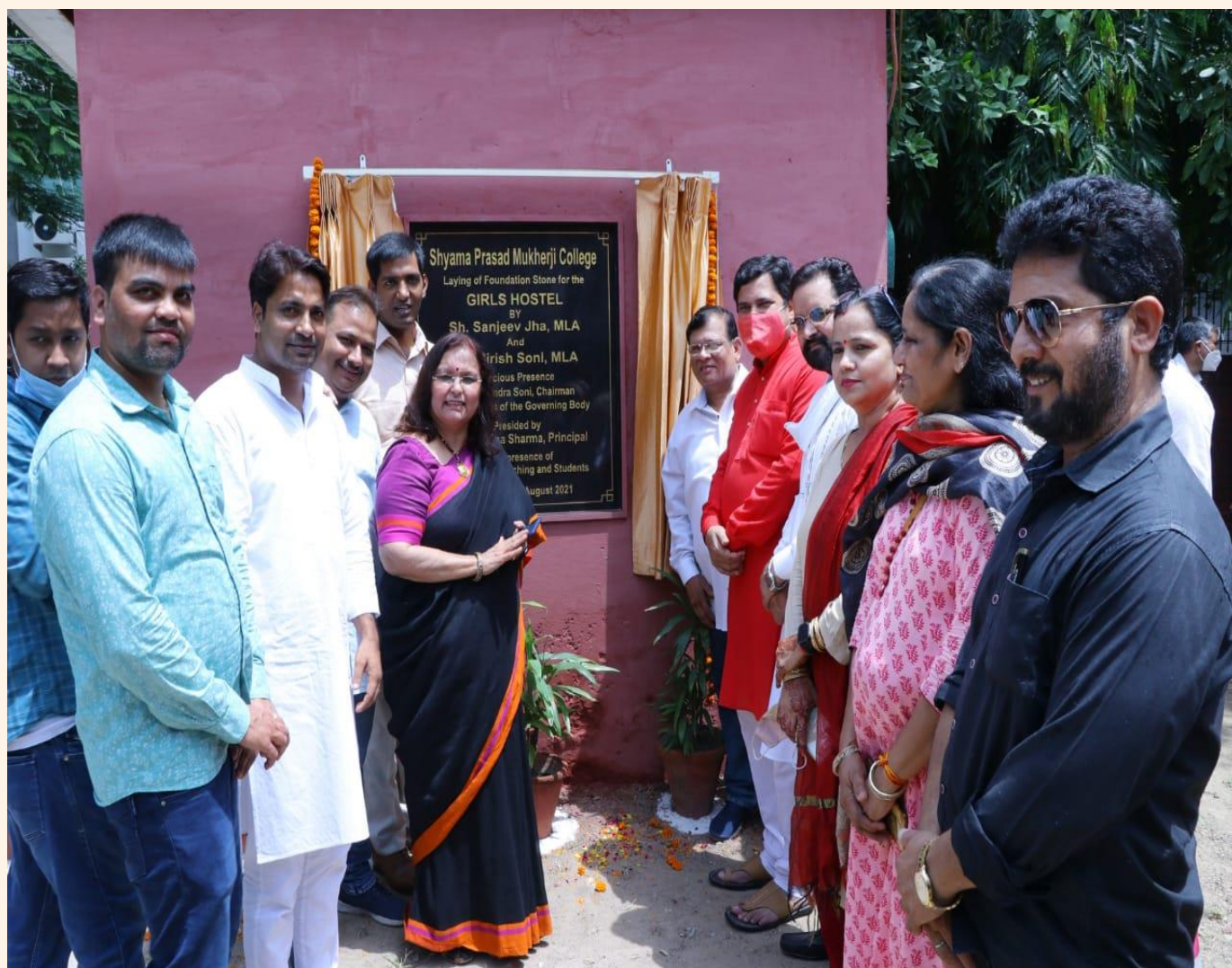
Foundation Laying Ceremony of the College Hostel for Girls - 13.08.2021

SPM College Website: http://spm.du.ac.in/index.php?lang=en