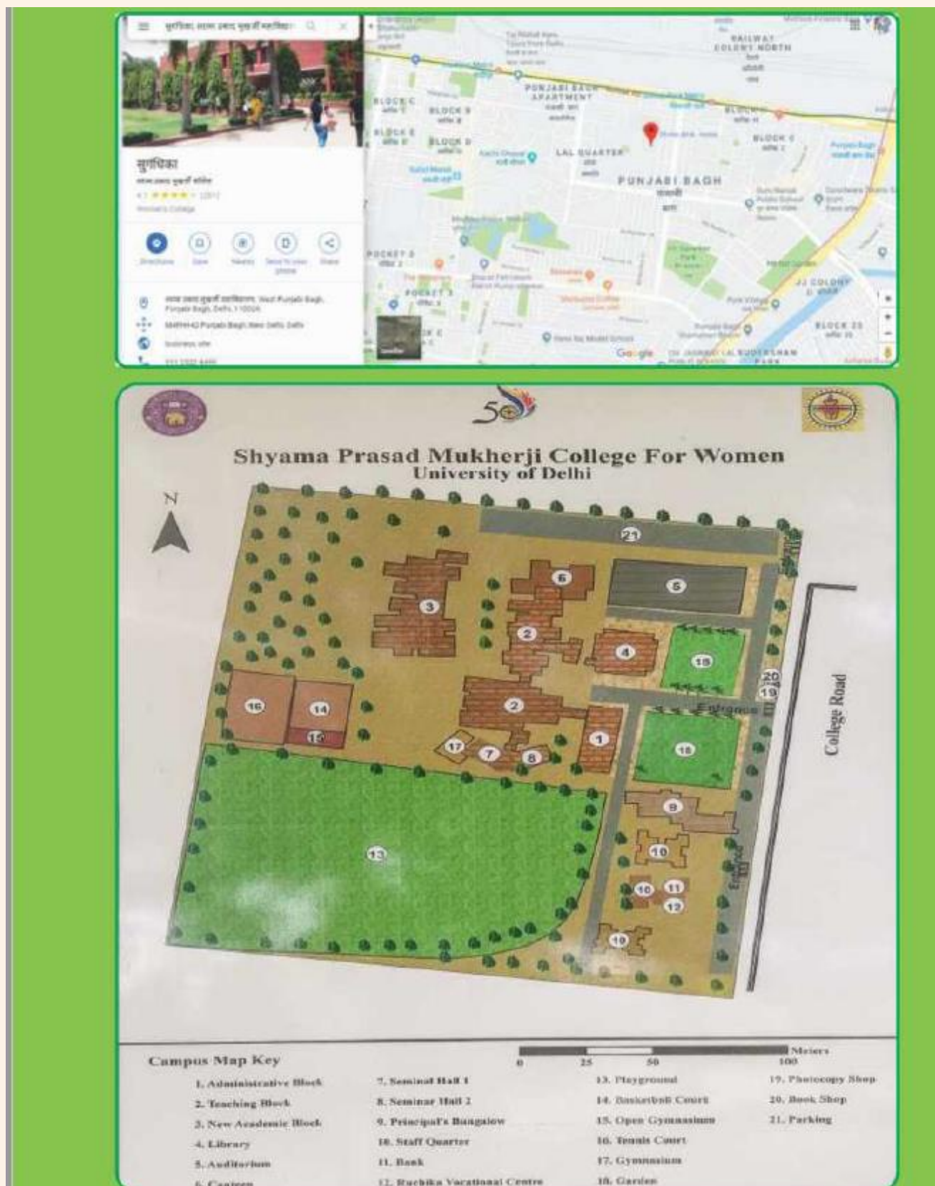
Cover Page Illustration: Pranjali Kaushik, BA (Prog.) II Year