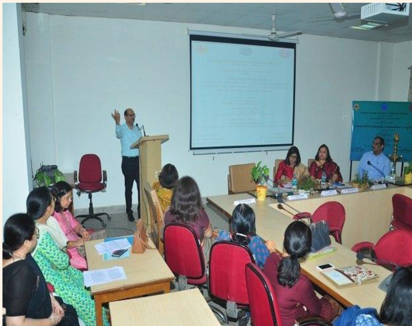
2-Day IQAC Workshop for Faculty Members, 2019