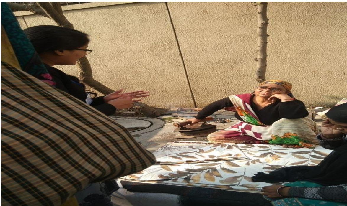
Photo: a volunteer after teaching a shopkeeper how to use PayTM meeting her on a re-visit