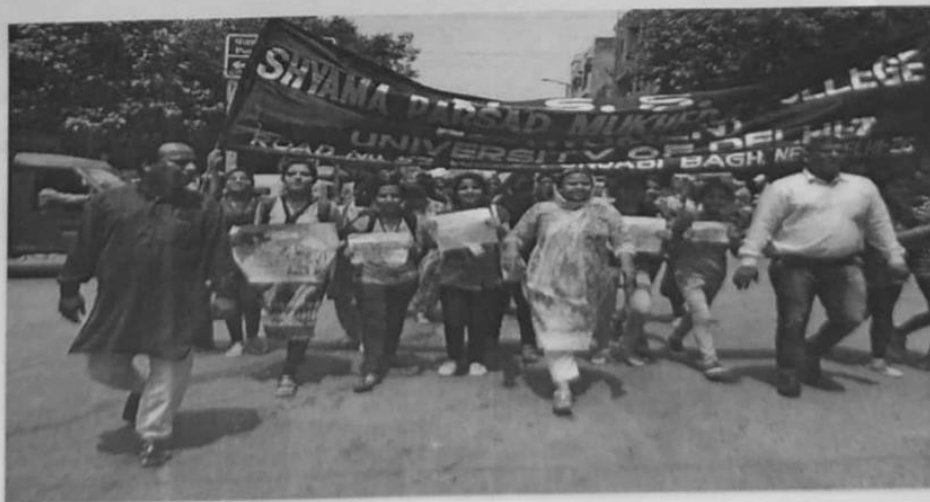
Swachhta Pakhwada Awareness Rally