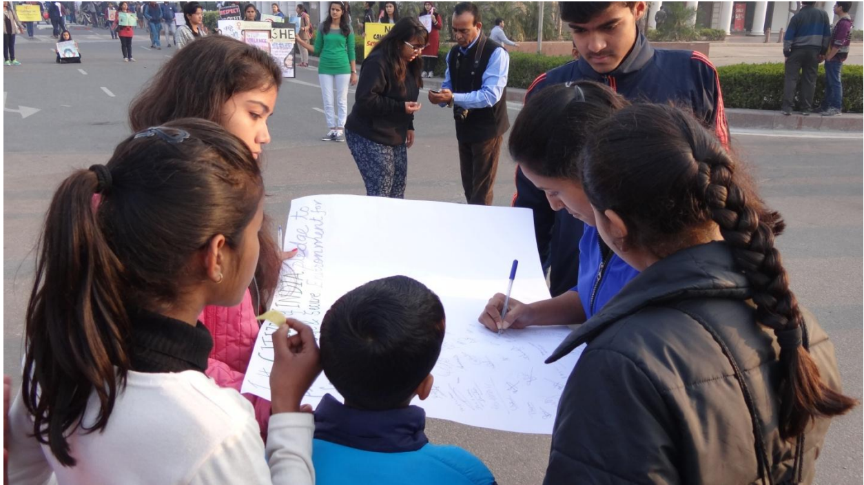
Signature CAMPAIGN at RAHAGIRI